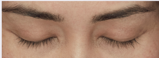
BEFORE Without LATISSE® and without mascara