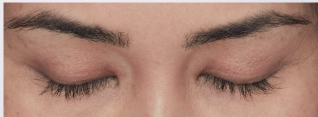
AFTER At week 16, with LATISSE® and without mascara

Real patient. Results may vary. Paid user. PRESCRIPTION ONLY. Unretouched, real lashes. No mascara. No extensions. No lash inserts.